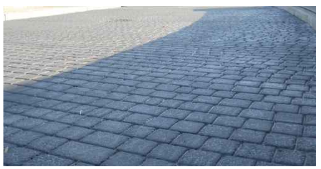
POSSIBLE OPTION: STREETPRINT SURFACE

File name: C:\Users\jmc\OneDrive\Projects\Wokingham\Projects\A329 Reading Road Active Travel - C2\PROJECT FILES\03\WPDRAWING\PHASE4\DR-CH-0103-FEASIBILITY.DWG, printed on 08 February 2024 11:50:32 by Drake, Chisale