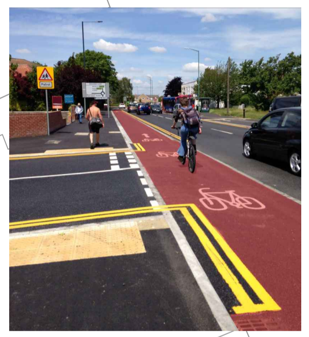
INDICATIVE SIDE ROAD JUNCTION WITH ONEWAY STEPPED CYCLEWAY